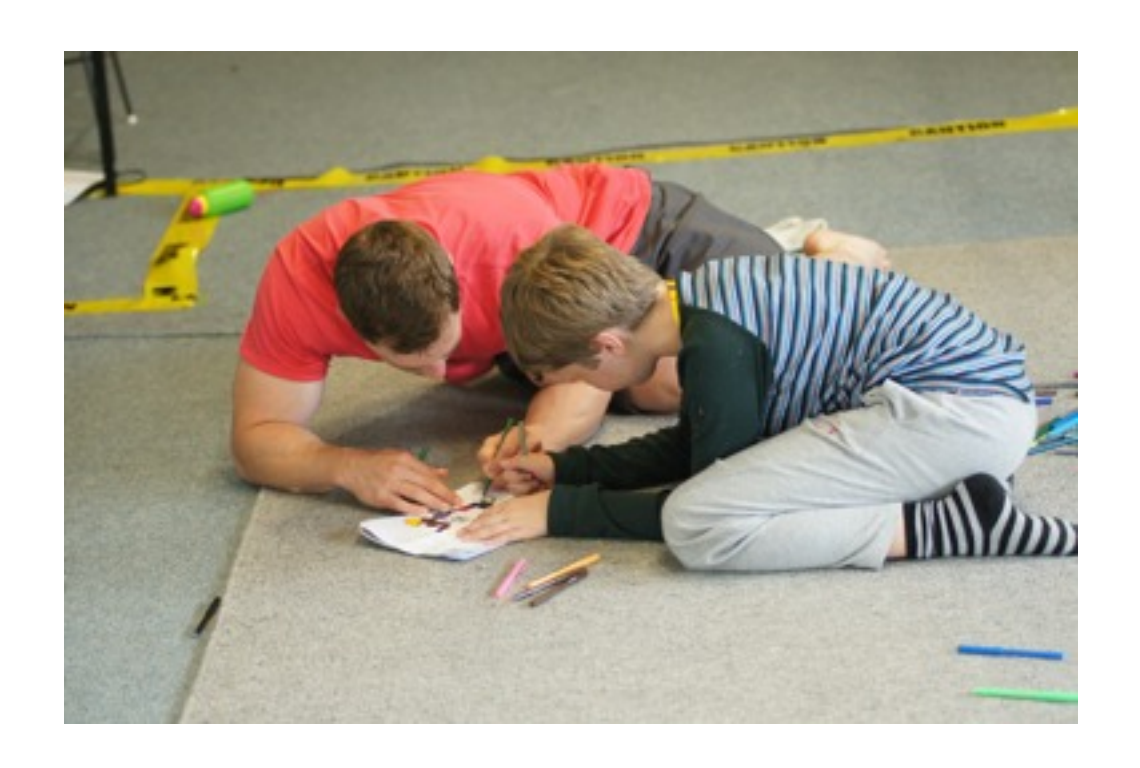
2012 Annual Report

Making a difference in the life of a child, one child at a time!